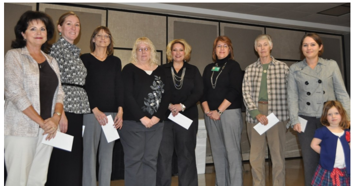
2011 CFSEK General Grant Recipients

Mother to Mother Ministry – Bourbon County – Resource for Basic Needs Assistance - Funding to provide parenting classes, fatherhood support as well as basic needs for families with children.