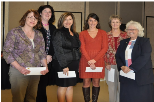
2011 Rosalie Manley Endowment Grant Recipients

NAMI– Empowering Mental Health Consumers & Family Members –Funding to train mental health consumers and family members to implement signature educational programs about mental