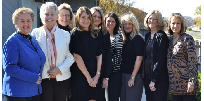
Members of Rita J Bicknell Women's Health Fund

Horses of Hope – Funding will support the “H.O.P.E for Healthy Living Mentoring Program” that will improve the mind, body and spirit of participants. The program pairs women with disabilities with able-bodied women mentors to work with equine therapy.