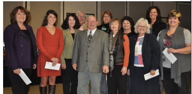
2011 Future Fund Giving Circle Grant Recipients

Along with the General Grant recipients, the CFSEK recognized non-profits who received grants from CFSEK's two giving circles, Future Fund and the Rita J Bicknell Women's Health Fund. Combined the giving circles were responsible for over $23,000 in grants for 2011. Giving Circles are groups of individuals who donate their own money to a pooled fund, decide together where to donate the funds and, in doing so, seek to increase their awareness of and engagement in the issues that concern our community.